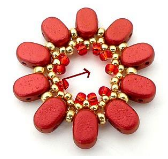
5) Here is the result © Exit HERE through the SB11