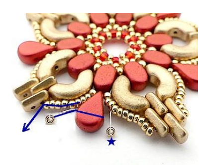
19) Pick up 1 SB15 at each side of the Amos (top hole). Exit through the next 6 SB15