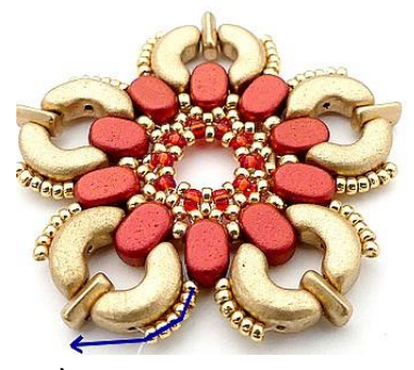
11) Repeat steps 8 to 10. Here is the result © Exit through the Seed beads HERE