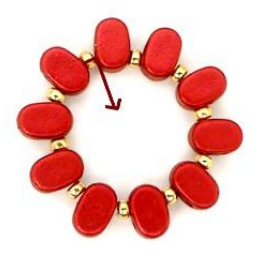
1) Place alternately 10 SB11 and 10 Lipsi. Close