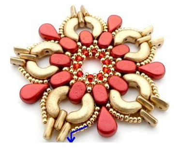
15) Here is the result © Exit through the SB15 HERE