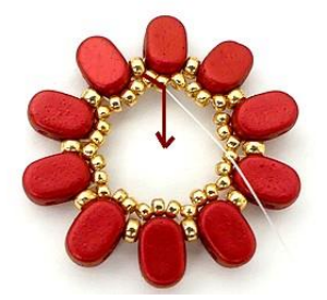
3) Here is the result © Exit HERE through the central SB15