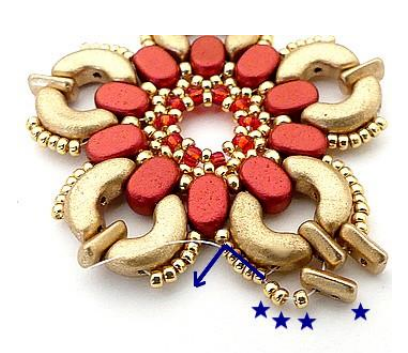
13) Pick up 1 Piros and 3 SB15 through the 5 SB15 HERE