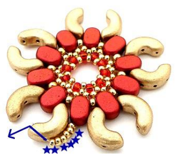
8) Pick up 6 SB15 through the Arcos