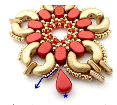
14) Pick up 1 Amos and exit through the 5 SB15 HERE. Repeat steps 12 to 14.