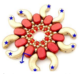
7) Place the Arcos like picture © Exit HERE through the Lipsi