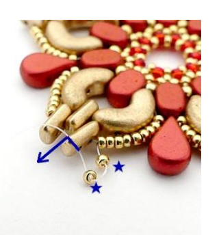
16) Pick up 2 SB15 through the Piros (top hole)