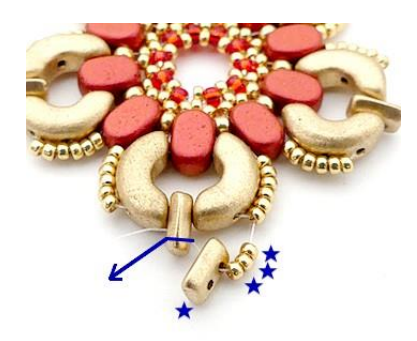
12) Pick up 3 SB15 and 1 Piros through the Piros HERE