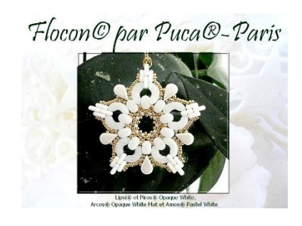
21) Another color 😊

I wish you a happy beading. I offer you this pattern. Please do not change its design and only use Les Perles par Puca®- Paris If you publish or share this pattern « THANK YOU » for not forgetting to notify that it is Puca® who created it.