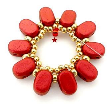
4) Pick up 1 SB11 between each central SB15