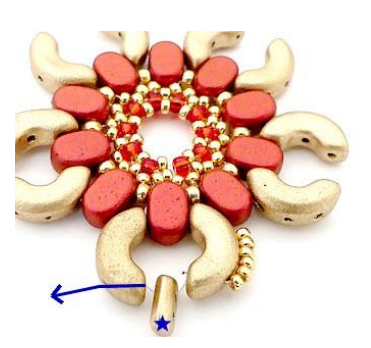
9) Pick up 1 Piros between the two Arcos