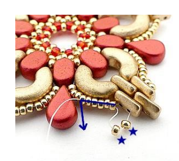
18) Pick up 2 SB15 through the first 6 SB15