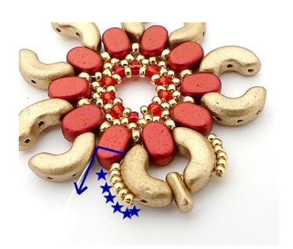
10) Pick up 6 SB15. Exit HERE through the Lipsi