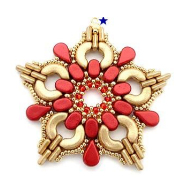
20) Repeat steps 16 to 19 per tutto il giro except the last tip. Pick up 1 Pilos or jump ring between the Piros and reinforce