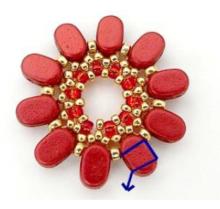
6) Pick up 1 SB15 between each SB11 and exit HERE through the Lipsi (top hole)